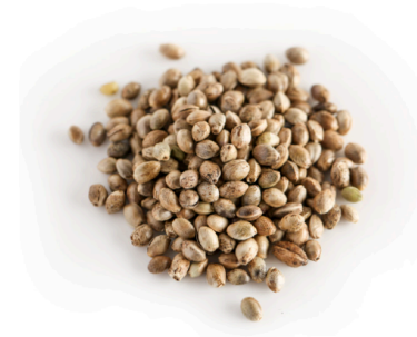
Roasted Hemp Seeds