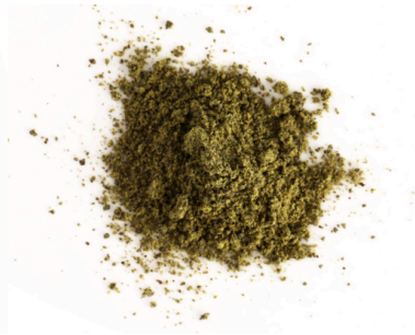
Hemp Protein 50, 33 and 23