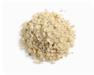
Shelled Hemp Seeds