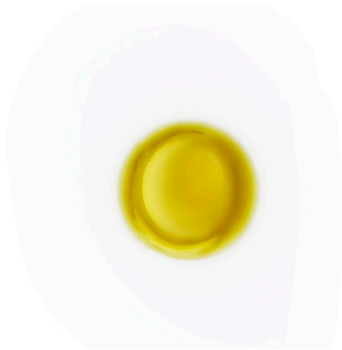
Cold-Pressed Hemp Seed Oil